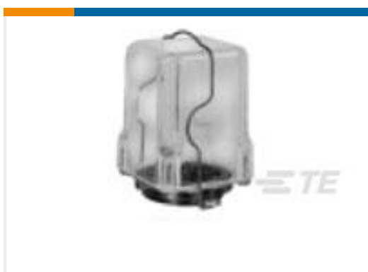
TE Part #3-1393159-3 20C176=SPRING