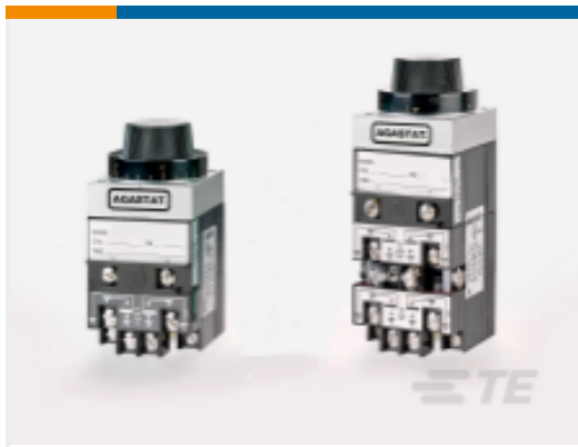
TE Part # 2-1423159-6 7012PD=RLY,STD,ON,2P, 125VDC,50