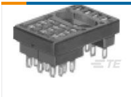
TE Part #9-1393159-5 40G432=INSUL,SKT TRACK MTG,R10