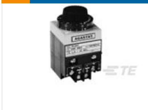
TE Part #1423162-5 7022AC=RLY,STD,OFF,2P 120VAC,1