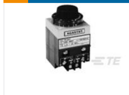
TE Part #1423162-7 7022AD=RLY,STD,OFF,2P, 120VAC,5