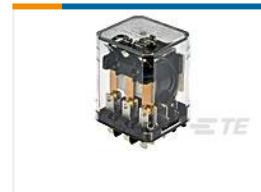
TE Part #4-1393118-2 KUP-17A19-120=KU