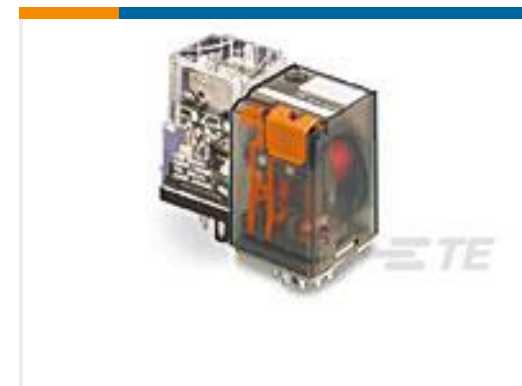
TE Part #4-1393104-4 KRPA-11DG-125=KRPA