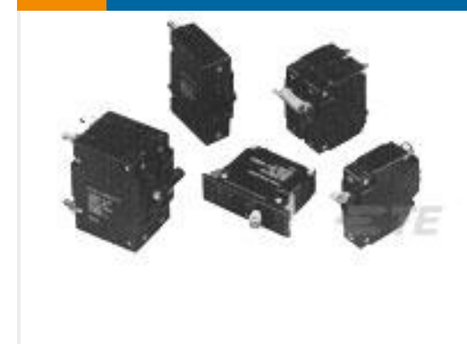
TE Part #6-1393252-2 W67-X2Q12-5=M6/M7/M9 /W6/W7