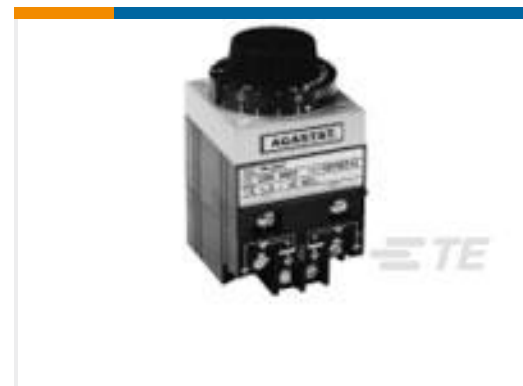
TE Part #1423157-5 7012AC=RLY,STD,ON,2P, 120VAC,15