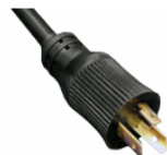
L5-20P Locking Type