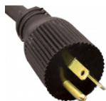
5-20P Straight Blade